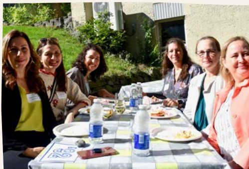
Top: the class of 1982 Bottom: the class of 1992