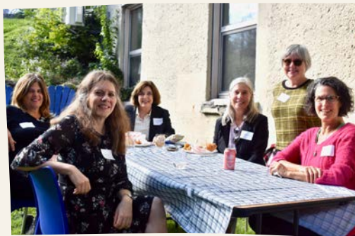
Bottom: the class of 1977