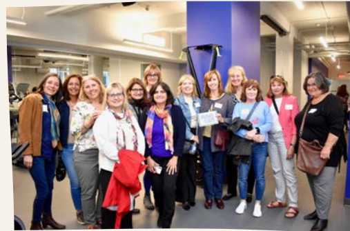
Our anniversary classes!