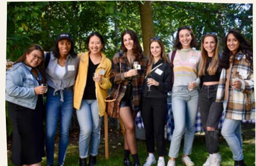
Top: the class of 2007 Bottom: the class of 2012