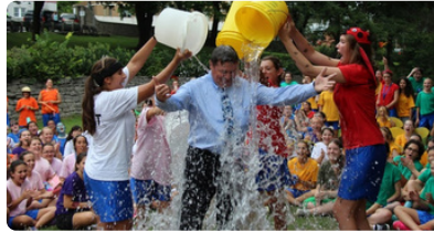
2014, ALS Ice Bucket Challenge