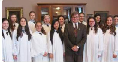
2013, with graduates after Prizes