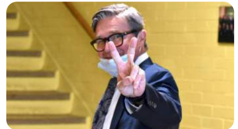
2021, back to school!