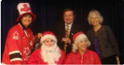
2011, Christmas around the World