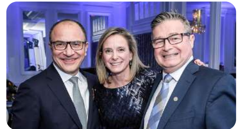
2020, Annual Winter Gala