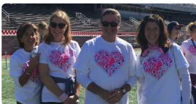
2016, Girls for the Cure