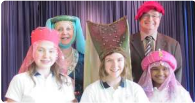
2012, Parade de Parures de Têtes