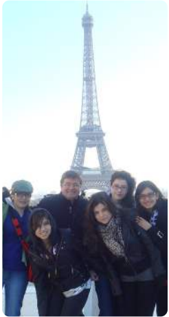
2010, Europe Trip