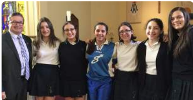
2015, with '15-'16 Prefects