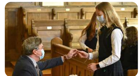
2022, Ribbons Ceremony