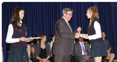
2018, Prizes Ceremony