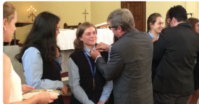
2017, Prefect Pin Ceremony