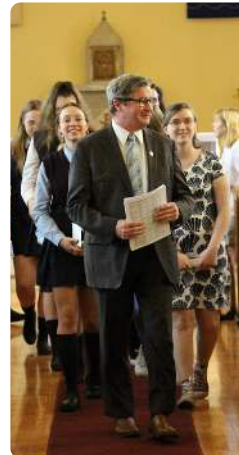
2019, AMASC Pin Ceremony