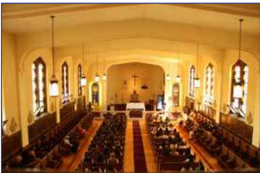
Alumnae and graduates fill the Chapel for the annual Pin Ceremony