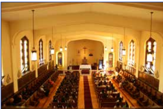
Alumnae and graduates fill the Chapel for the annual Pin Ceremony